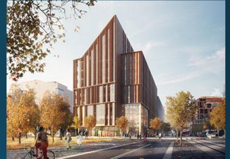
The Arbour, George Brown College