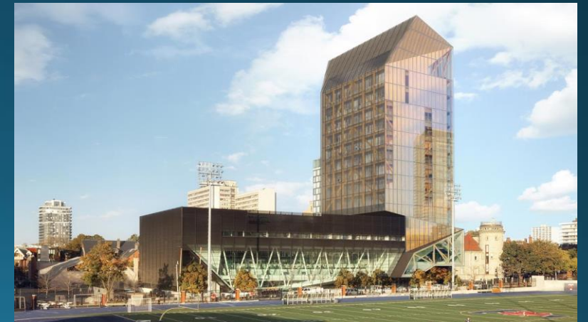
Goldring Centre, University of Toronto